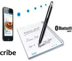
Livescribe Smart Pens