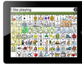
Communication Apps for the iPad