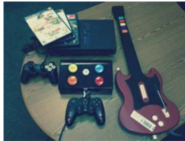
Switch-adapted PS2 Gaming System including Guitar Hero