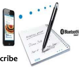
Livescribe Smart Pens