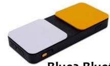
Blue2 Bluetooth Switch for iPad

Become a FREE member and request a loan directly from our website! Over 2,000 pieces of AT are available for loan and demonstration.