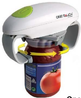
One Touch Electric Jar Opener

Become a FREE member and request a loan directly from our website! Over 2,000 pieces of AT are available for loan and demonstration.