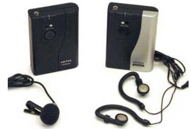
FM System For Assisting with Hearing Loss